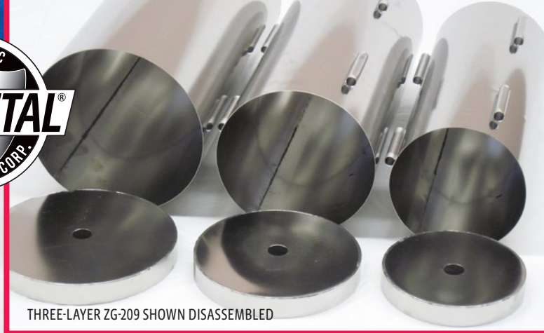
THREE-LAYER ZG-209 SHOWN DISASSEMBLED

The number of concentric shields (layers) required is a function of the degree of Attenuation (A) desired. Typically three layers are required, however, additional layers may be added. The external field strength ( H_0 ) and the maximum allowable magnetic field inside the chamber ( H_i ), or the required attenuation, are determined by the customer. To achieve internal magnetic fields of 10 milliGauss or less, additional layers and a Degaussing Coil are usually required.