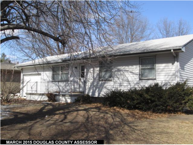
MARCH 2015 DOUGLAS COUNTY ASSESSOR