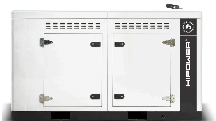
Photo depicts a typical model but may include optional accessories.