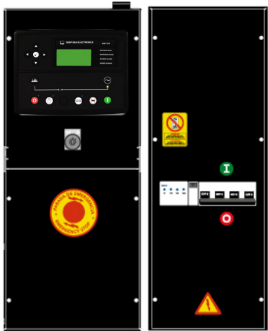
Pictures of Control Module LH and Control Panel RH may include optional equipment and/or accessories

CONTROLLER : The DSE 7310 digital microprocessor control module continuously monitors the status of the engine and generator and allows programming in the field. It includes Stop-Manual-Auto modes with LED indicators and test buttons for stop/ reset, manual,auto and start modes. Two dry contacts are included for additional auto start function. A tamper-proof hour meter is also supplied.