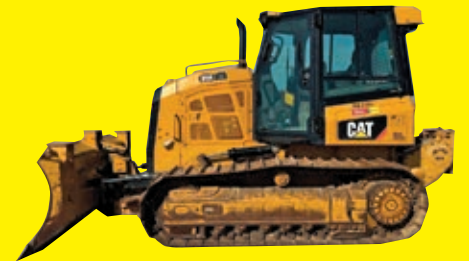
2017 CAT D5K2XL SN:KW202752 powered by Cat diesel engine, equipped with EROPS, air, heat, rear screen, Grade Control, AccuGrade ready, Allied H4A winch, 6 way blade, long track frame, 3,603 hours.