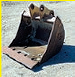
CP 36IN. DIGGING BUCKET fits Cat 308E, 45mm, rib spacing, 7 3/8, center to center 12in.