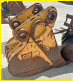
CAT 24IN. DIGGING BUCKET 80mm, rib spacing 12in. Center to center 17 1/2in.