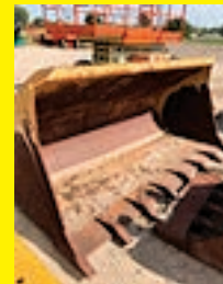
2021 CAT 3 YARD COUPLER GP BUCKET for Cat IT12/IT36.