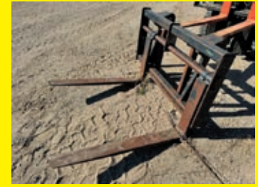
(2) CAT 48IN. FORKS for Balderson coupler, fits Cat 938.