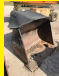
2014 CAT 1.5 YARD LIGHT MATERIAL BUCKET SN:3J10200037 for Cat 926M-950M.