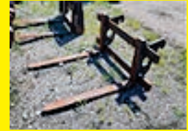
2014 44IN. FORKS for Cat 908H, 55in. Carriage. WERK-BRAU 60IN. FORKS RUBBED TIRED LOADER ATTACHMENT SN:263315-2-2