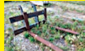
2014 54IN. FORKS for Cat IT38G, 60in. Carriage.