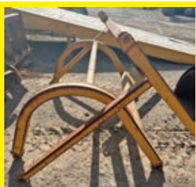
CAT SWEEPS for Cat D6R.