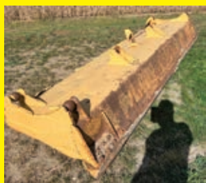
CAT DOZER BLADE for Cat D6R.