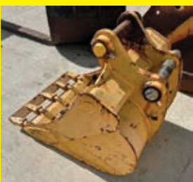
30IN. DIGGING BUCKET 60mm, rib spacing 8 3/4, center to center 12 1/4in.