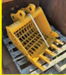
24IN. SKELETON BUCKET for Cat 303.