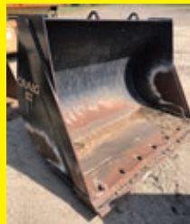
2014 CRAIG LM-2 YARD LIGHT MATERIAL BUCKET SN:T14040147 for Cat 926M-950M.