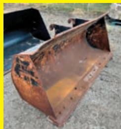
(2) 92IN. GP BUCKET 50mm pins.