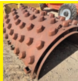
84IN. PADSFOOT SHELL KIT