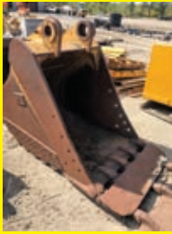
2021 CAT 42IN. DIGGING BUCKET W/ TEETH for Cat 324D/325D. CB LINKAGE 90mm, rib spacing 13 3/4, center to center 19in.