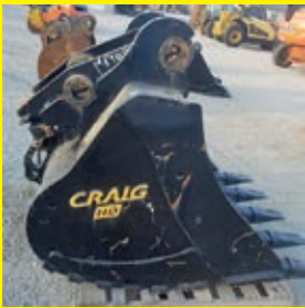
CRAIG 42IN. HD542 DIGGING BUCKET for wedge style coupler, 80mm, rib spacing 12 3/4, center to center 17 1/2in.